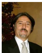
Canip Baran, Ankara, Turkey